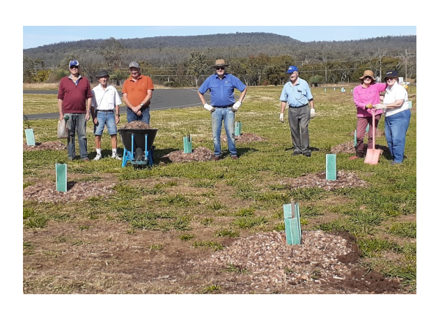
And some new planting